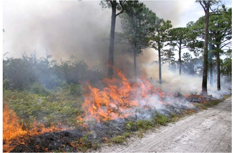
Prescribed fire to restore habitat

Very little is known on Scrub-Jay relocation and this project will be an excellent opportunity for the scientists involved in the project and, if successful, will benefit the species otherwise condemned. Currently the pine canopy density at SLCA is still too dense for the Scrub-Jays and continued restoration is currently underway to have the site ready by November.