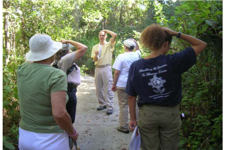
Volunteers get a student's-eye view of the new activities they will soon be conducting at the Enchanted Forest.

In response to these revisions, the EEL Program has re-designed the school programs offered at the Enchanted Forest Sanctuary and the Barrier Island Center. One of the goals of the Enchanted Forest is to essentially turn the Center into a type of outdoor 'field station' where students participate in hands-on environmental science activities that build on ideas and skills learned in class – all while learning the importance of some natural resources here in Brevard County.